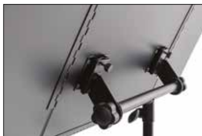
Details of music desk connection device on MS-320