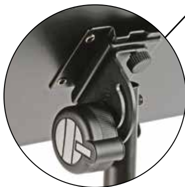
Details of music desk connection device on MS-330