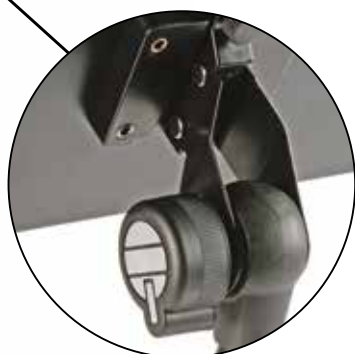
Details of music desk connection device on MS-331