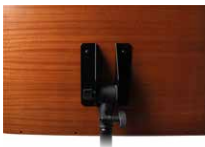
Details of music desk connection device on MS-332