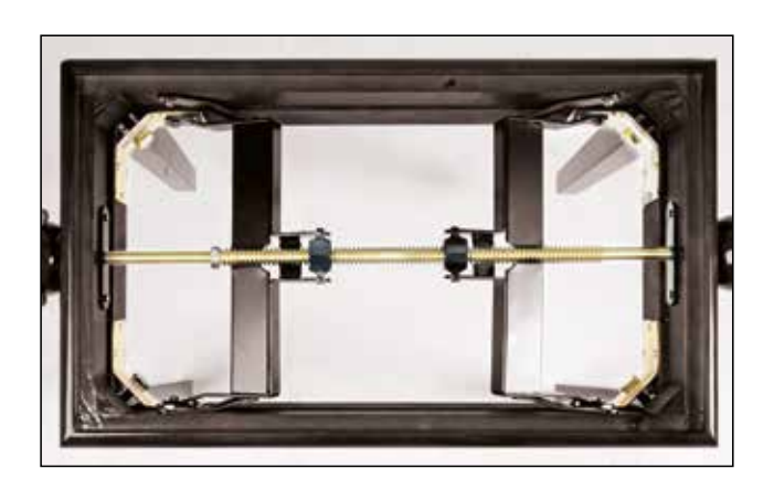
Mechanical details of height adjustability device