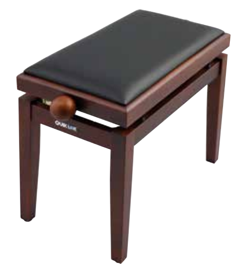
Details of height adjustability device and durable, textured vinyl covering found on the PB/100 series wood piano benches