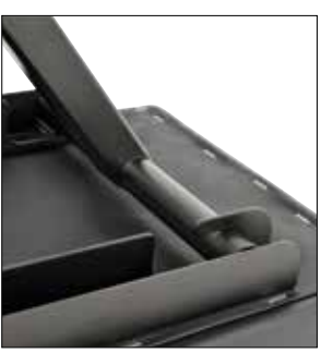
Details of innovative height adjustment system found on the BX/9, BX/8 and BX/14 keyboard benches. Fast, practical and secure locking system with double steel rails and dual snap-in leg design for added safety. Simply slide leg into the two slots found on parallel steel rails and force in to firmly lodge.