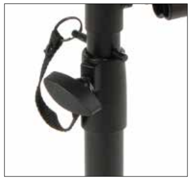
Details of leg-joint and height-adjustability clamp designed to ensure maximum safety and amazing stability