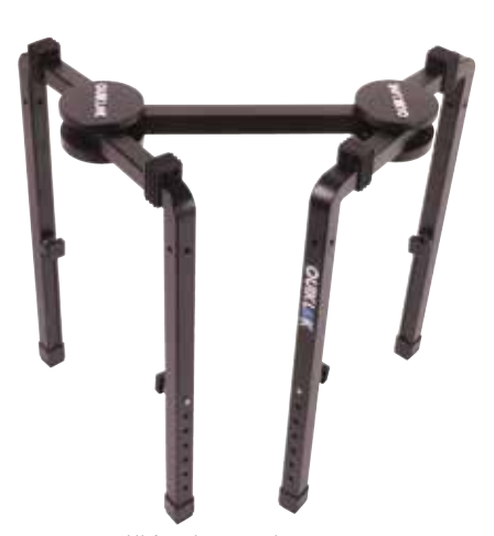
All four legs can be swung into position to conform to the size and shape of your equipment.

Simply swing legs back and the stand folds down to convenient "T" for easy transport.