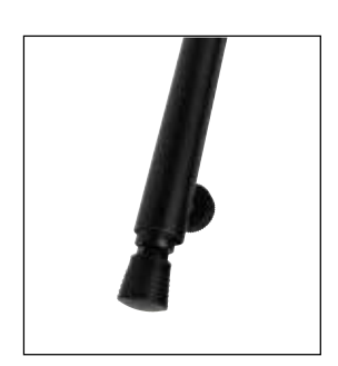
Legs are height adjustable to 10 positions from 25.6" to 43.3" (65 to 110 cm)