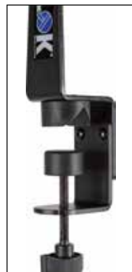
Details of IPS/16 tightening clamp device