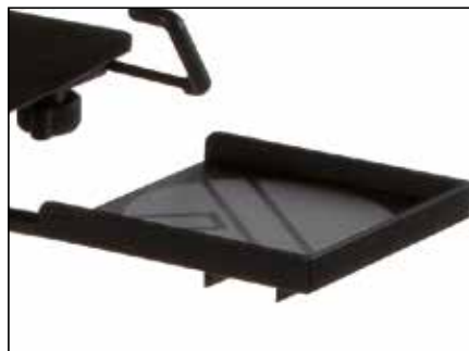
Details of LPH/004 pull-out, tilt-adjustable mouse tray