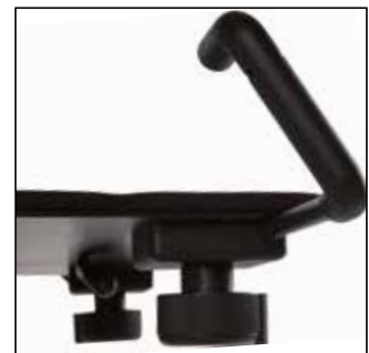
Details of LPH/004 laptop clamping device