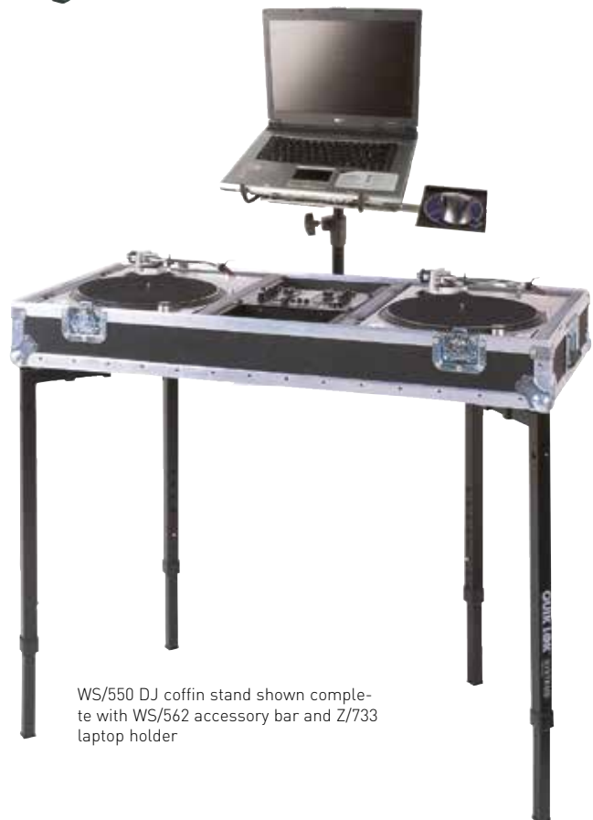
WS/550 DJ coffin stand shown complete with WS/562 accessory bar and Z/733 laptop holder